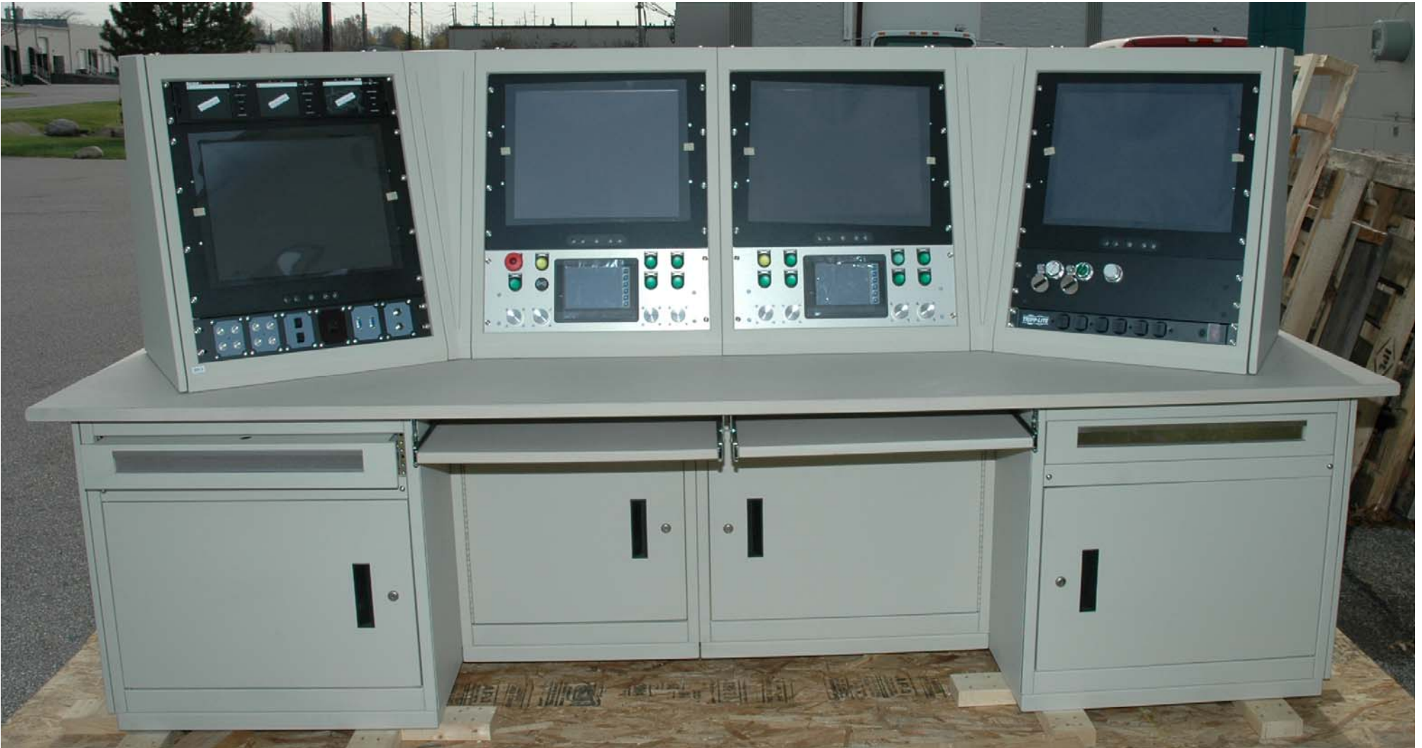
Custom control enclosure for Allison Transmission