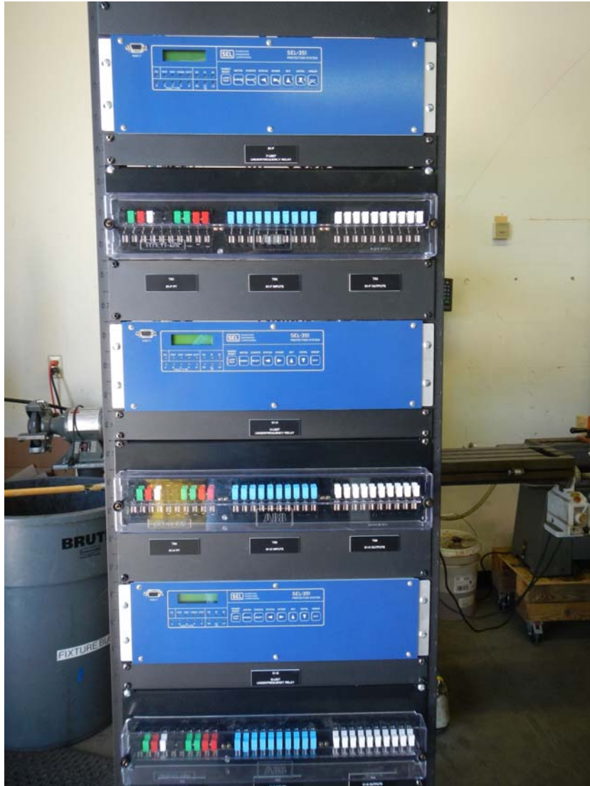
IPL Power substation