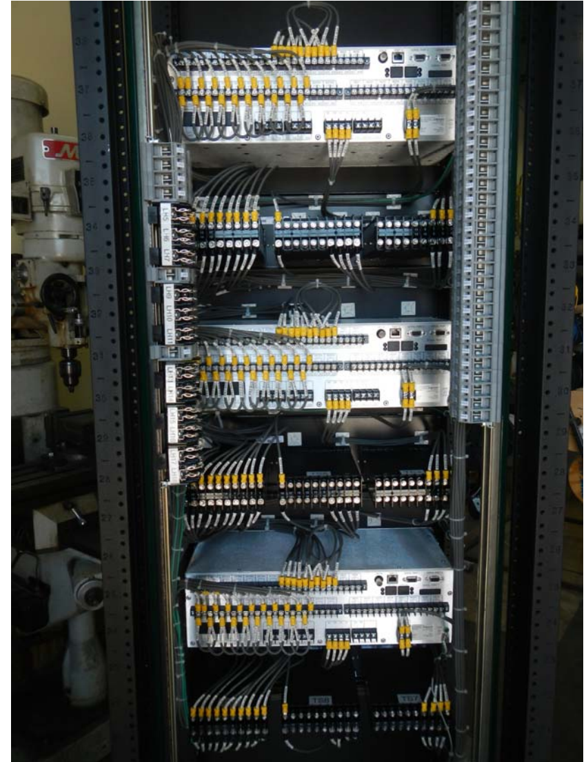
Control and monitoring panel